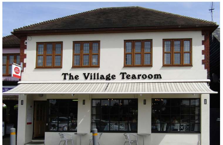
Hatfield Heath's own Village Tearoom